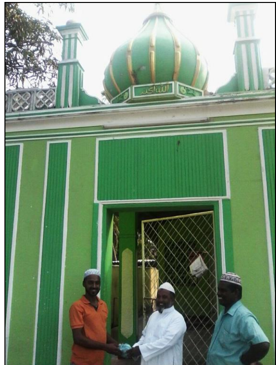
Sivala Palli, Moor Street, Jaffna