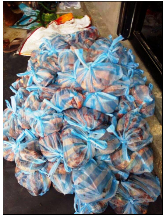
Jaffna District: Qurban packs for distribution