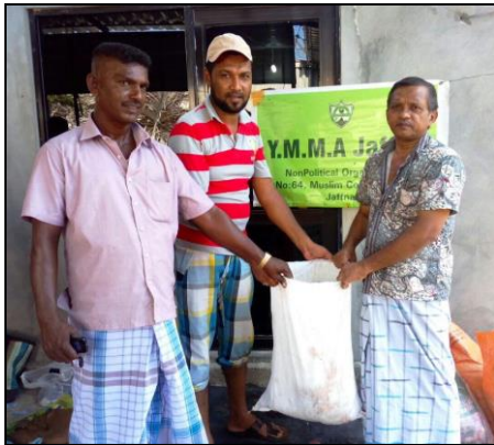
Point Pedro, Jaffna