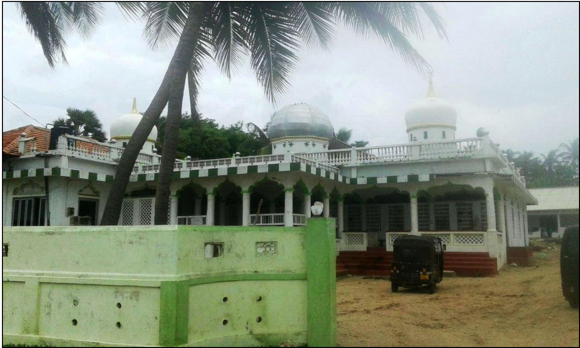
Mankumban Mosque, Jaffna