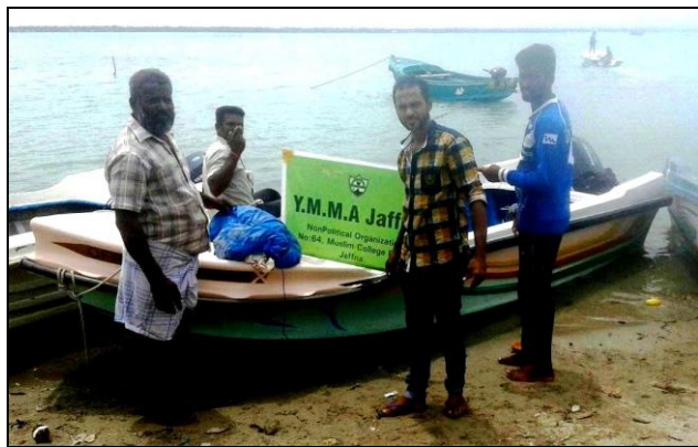
Nainativu, Jaffna: Qurban packs transported by boat